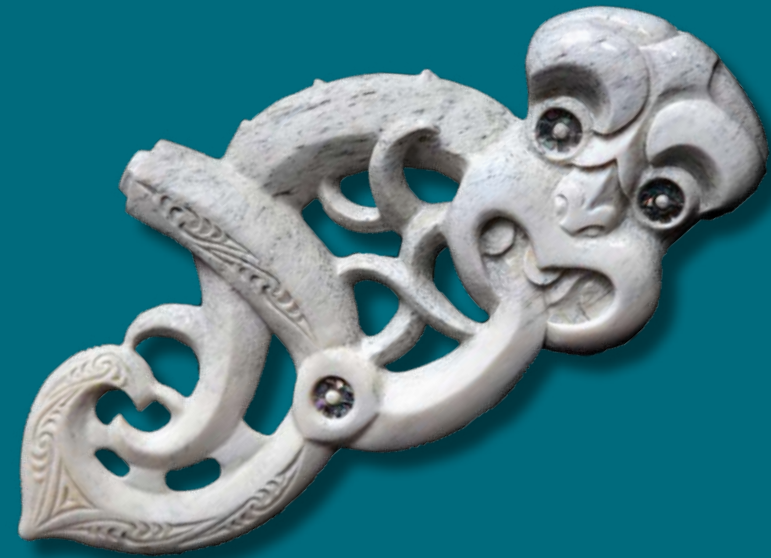
▲ Sea dragon carved from whale bone honoring Bioneers as a great living library of knowledge.

“The sea dragon of sacred whale is gifted to Bioneers as you are an inspirational group who have demonstrated a commitment to saving this Earth. Bioneers honor the whale as part of the web of life, understand its timelessness, its strengths and vulnerabilities. Bioneers continues to act as a conduit for many who seek to honor that code, not only through words but through action.”